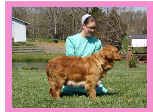
Felicity (Golden Retriever)