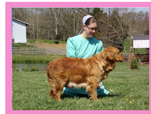
Felicity (Golden Retriever)