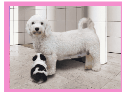
Paula (Bichon Frise)