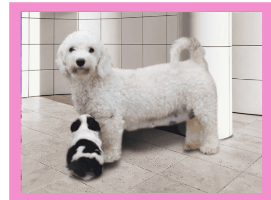
Paula (Bichon Frise)