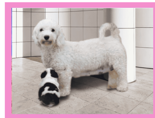
Paula (Bichon Frise)