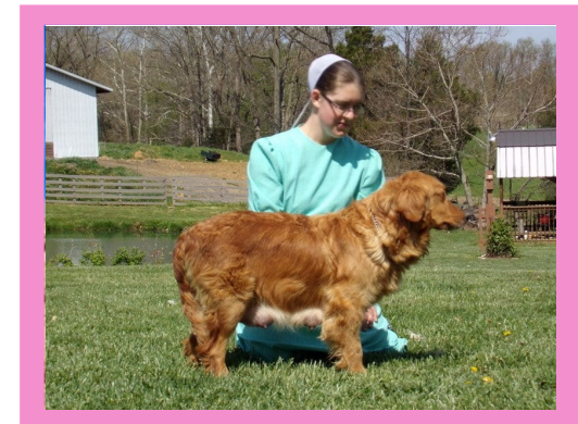
Felicity (Golden Retriever)