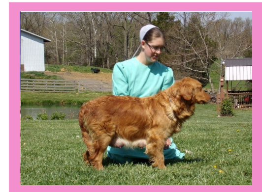
Felicity (Golden Retriever)