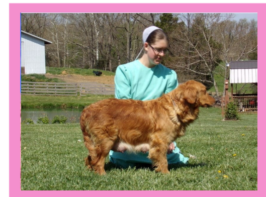
Felicity (Golden Retriever)