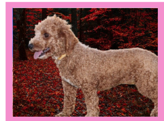
Addie (Poodle Mini)