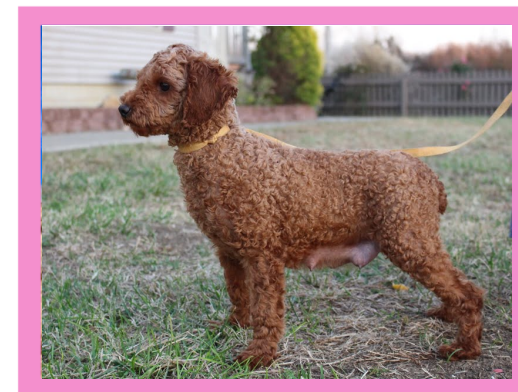
Kelly (Poodle Mini)