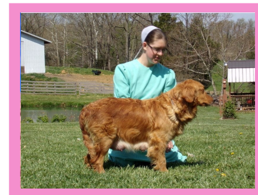
Felicity (Golden Retriever)