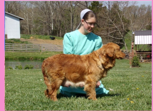
Felicity (Golden Retriever)