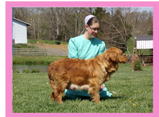
Felicity (Golden Retriever)