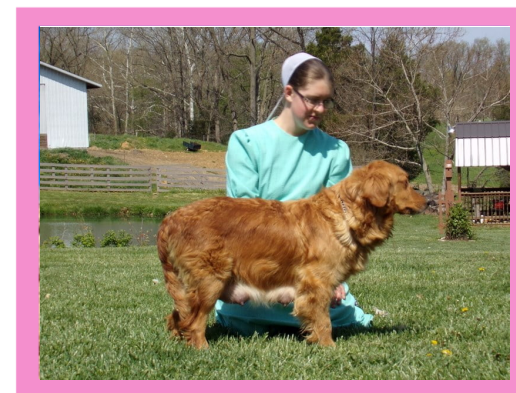
Felicity (Golden Retriever)