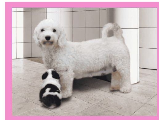
Paula (Bichon Frise)