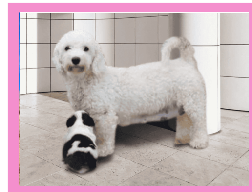
Paula (Bichon Frise)