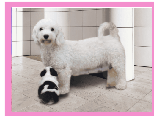
Paula (Bichon Frise)