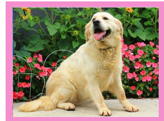
Snowflake (Golden Retriever)