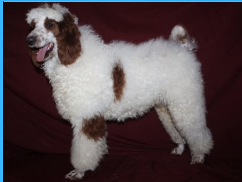
Lance (Poodle Standard)