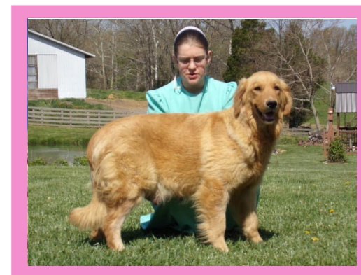
Denali (Golden Retriever)