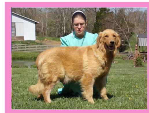
Denali (Golden Retriever)