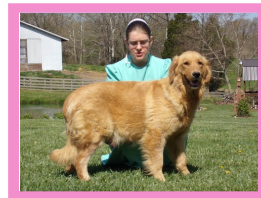
Denali (Golden Retriever)