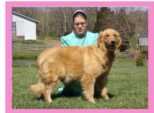
Denali (Golden Retriever)