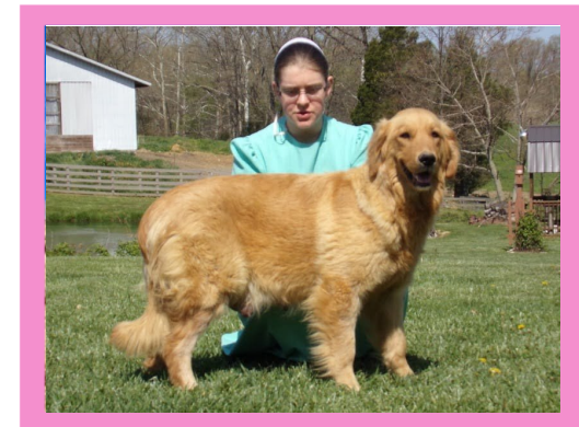
Denali (Golden Retriever)