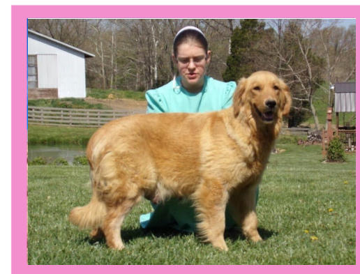
Denali (Golden Retriever)