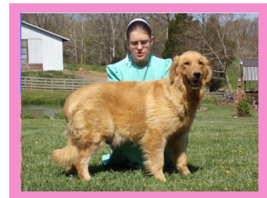
Denali (Golden Retriever)