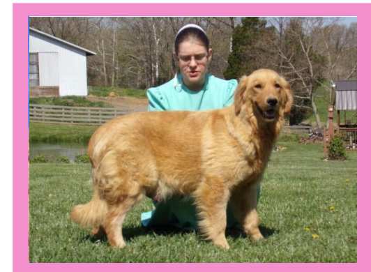
Denali (Golden Retriever)