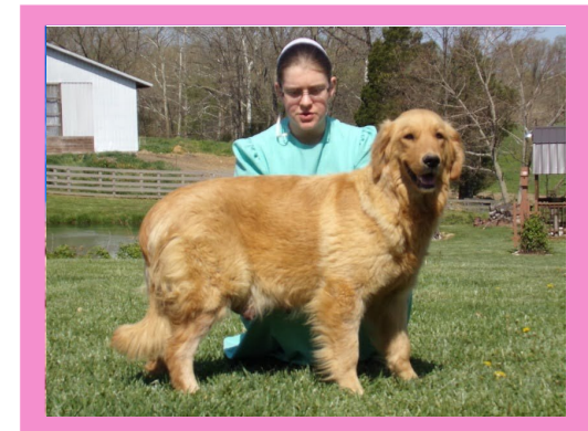
Denali (Golden Retriever)