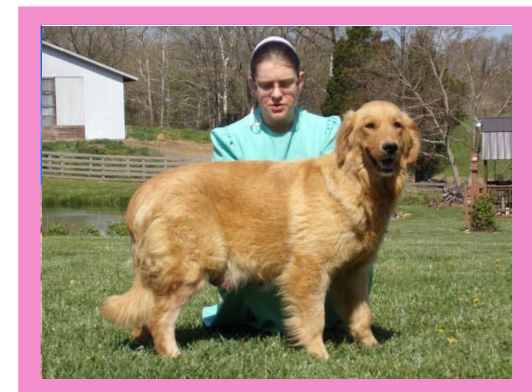
Denali (Golden Retriever)