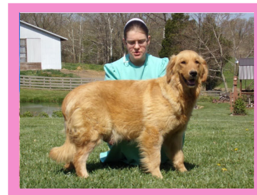
Denali (Golden Retriever)