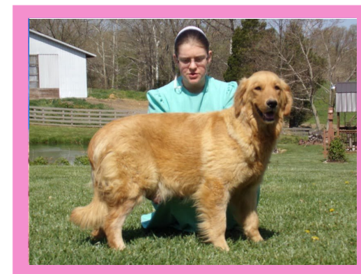
Denali (Golden Retriever)