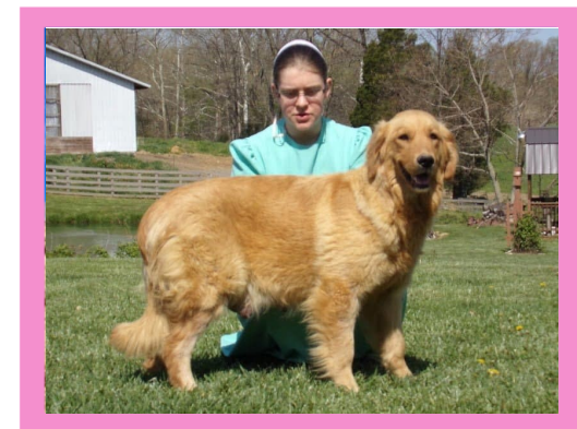
Denali (Golden Retriever)