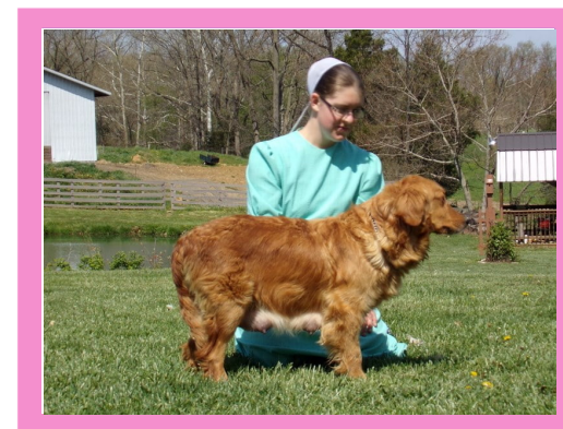
Felicity (Golden Retriever)