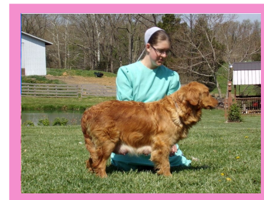
Felicity (Golden Retriever)