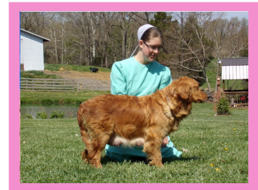
Felicity (Golden Retriever)