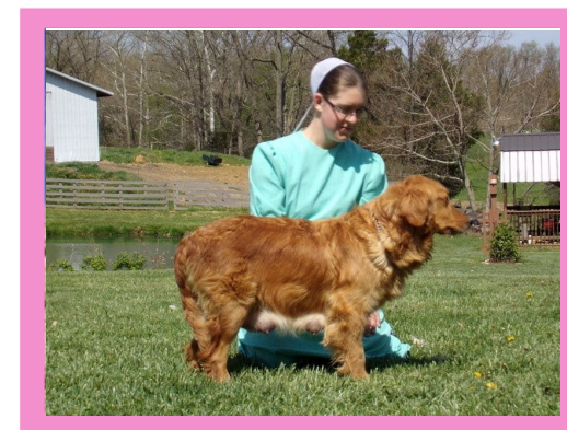
Felicity (Golden Retriever)