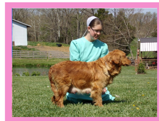
Felicity (Golden Retriever)