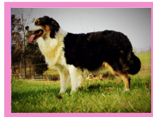
Queenie (Australian Shepherd)