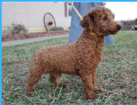
Ramsey (Poodle Mini)