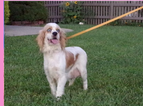
Firefly (Cocker Spaniel)