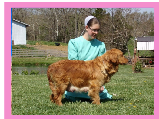
Felicity (Golden Retriever)