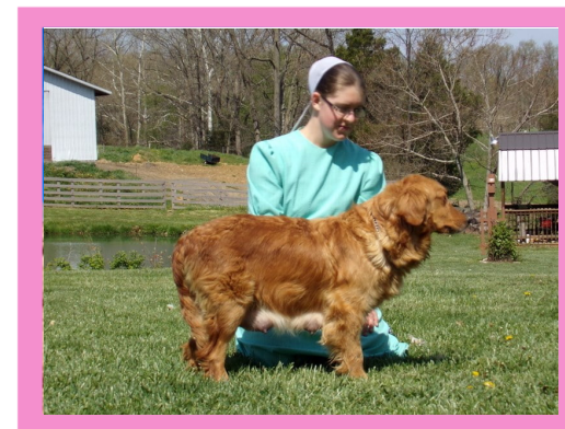
Felicity (Golden Retriever)