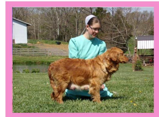
Felicity (Golden Retriever)