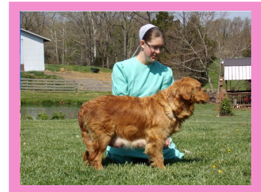
Felicity (Golden Retriever)