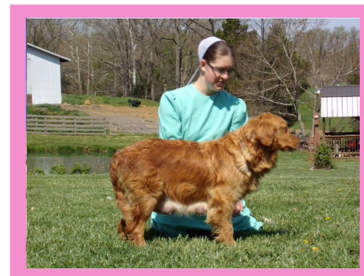
Felicity (Golden Retriever)