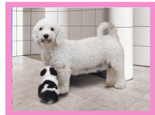
Paula (Bichon Frise)