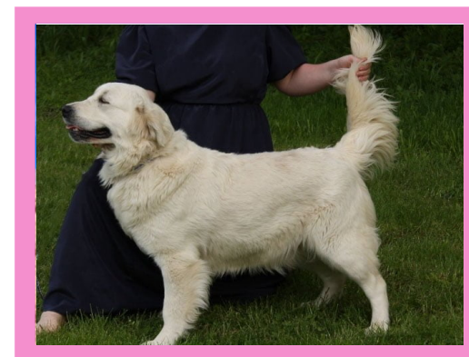
Princess (Golden Retriever)