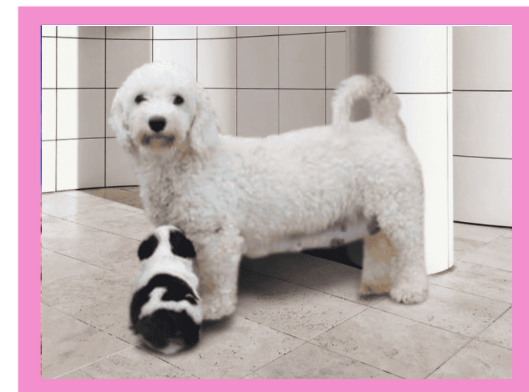
Paula (Bichon Frise)