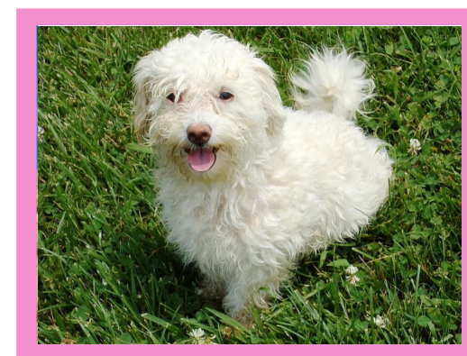
Reece (Bichon Frise)