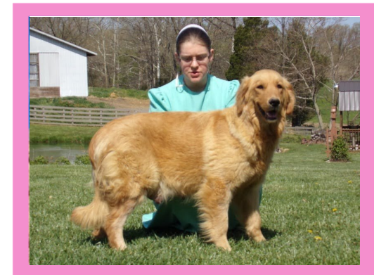
Denali (Golden Retriever)