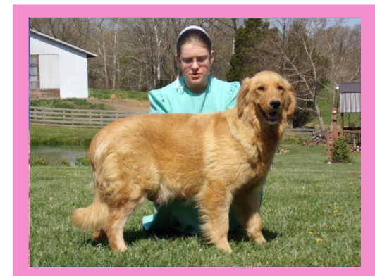
Denali (Golden Retriever)