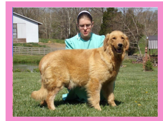
Denali (Golden Retriever)