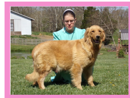
Denali (Golden Retriever)