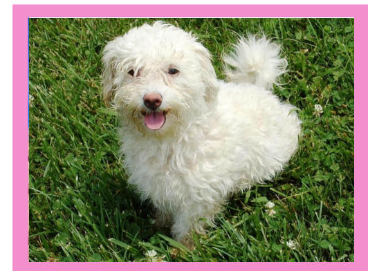
Reece (Bichon Frise)