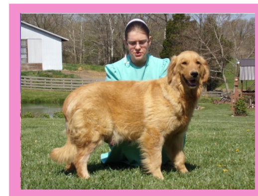
Denali (Golden Retriever)