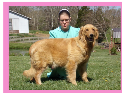
Denali (Golden Retriever)