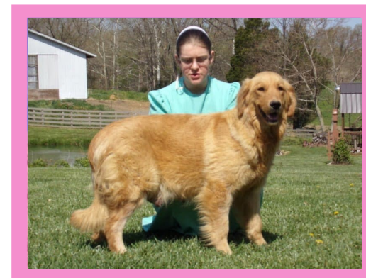
Denali (Golden Retriever)