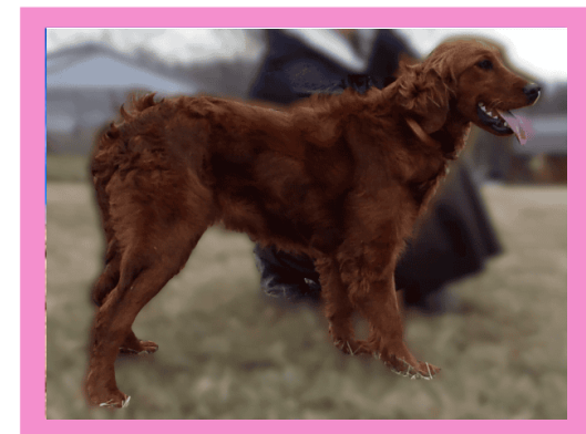
Sierra (Irish Setter/Golden Retriever)