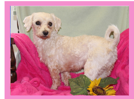
Tracie (Bichon Frise)