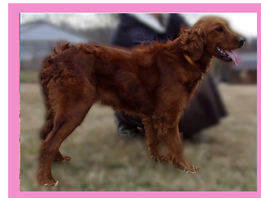
Sierra (Irish Setter/Golden Retriever)