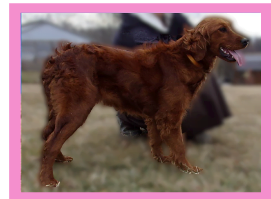
Sierra (Irish Setter/Golden Retriever)