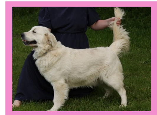
Princess (Golden Retriever)