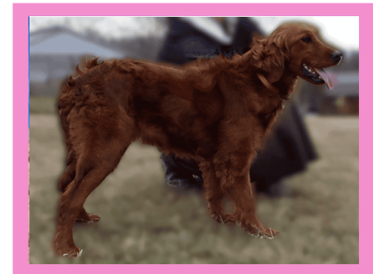
Sierra (Irish Setter/Golden Retriever)