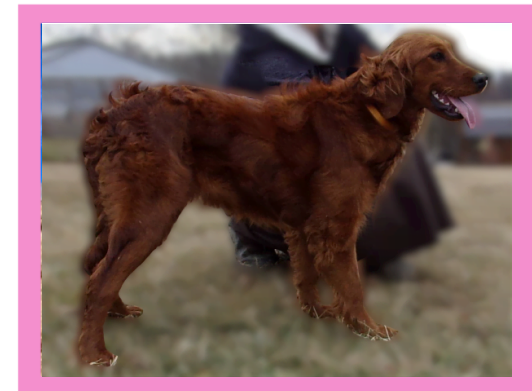
Sierra (Irish Setter/Golden Retriever)