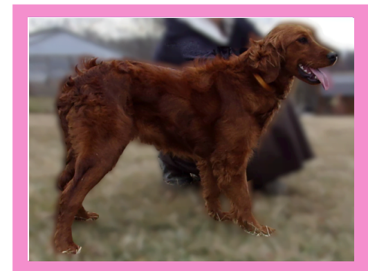
Sierra (Irish Setter/Golden Retriever)