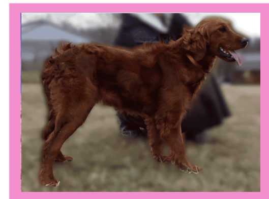
Sierra (Irish Setter/Golden Retriever)