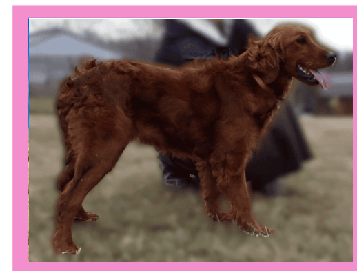
Sierra (Irish Setter/Golden Retriever)