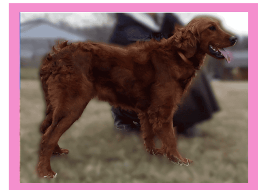
Sierra (Irish Setter/Golden Retriever)