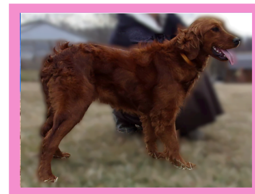
Sierra (Irish Setter/Golden Retriever)