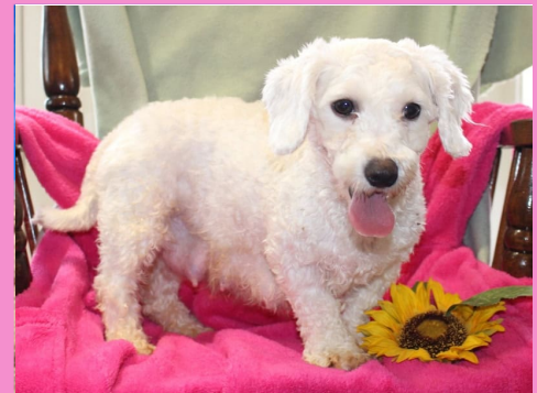
Patricia (Bichon Frise)